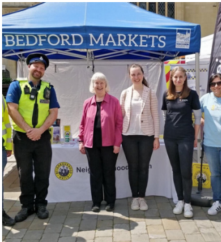
Bedford NW Association

We've also been given £250 worth of charity shop gift cards to distribute which we'll use to support vulnerable communities.