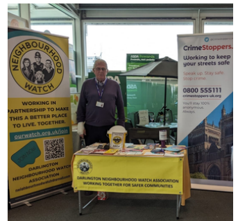
Darlington NW Association